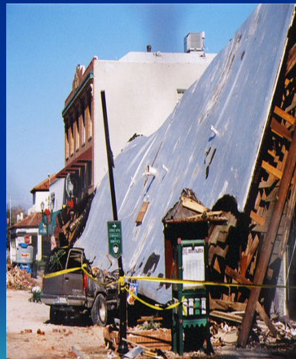
Paso Robles, CA