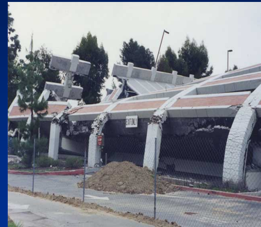
Northridge Fashion Center