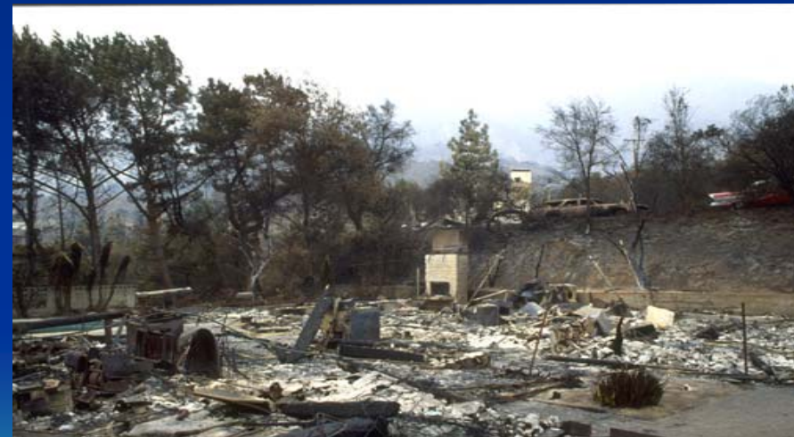
Destroyed Apartment Buildings