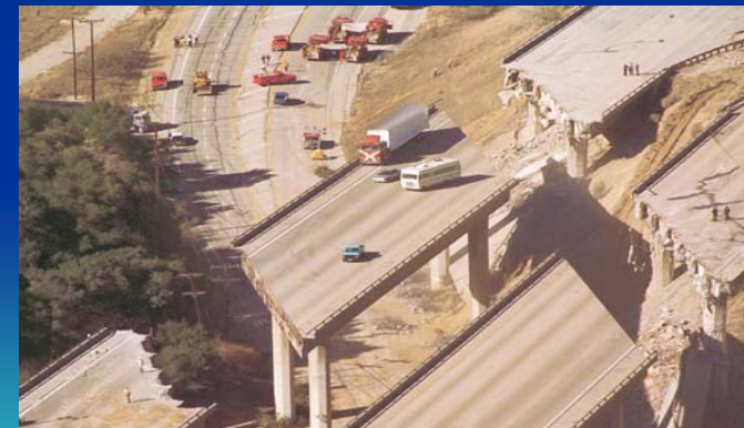
I-5 Freeway - Santa Clarita