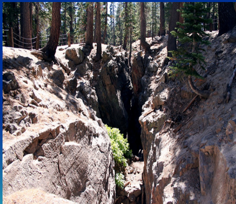
Mammoth Earthquake Fault