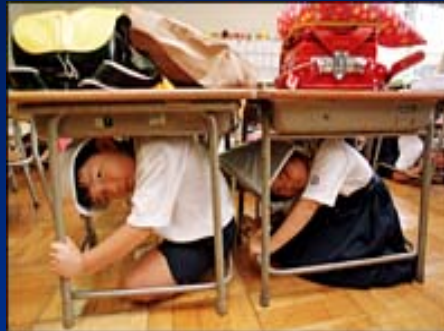
Drop, cover & hold on