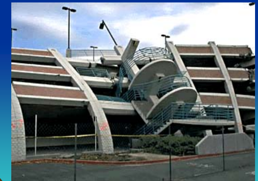
Northridge Fashion Center