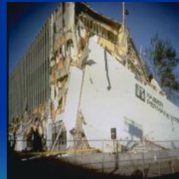
Kaiser – Granada Hills